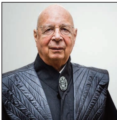
Klaus Schwab of the WEF

While they might still disagree over the exact origins or severity of Covid, they are